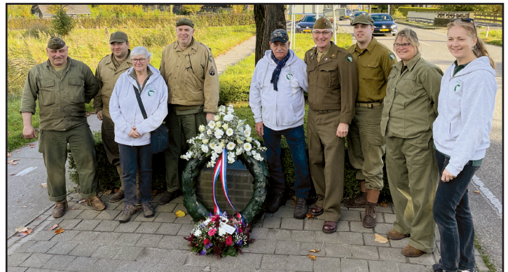
Our Netherlands Friends