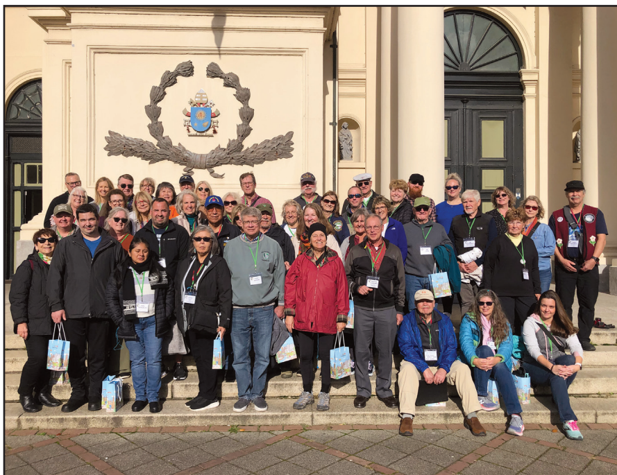
The tour group on the front steps of the Oudenbosch Basilica in the Netherlands